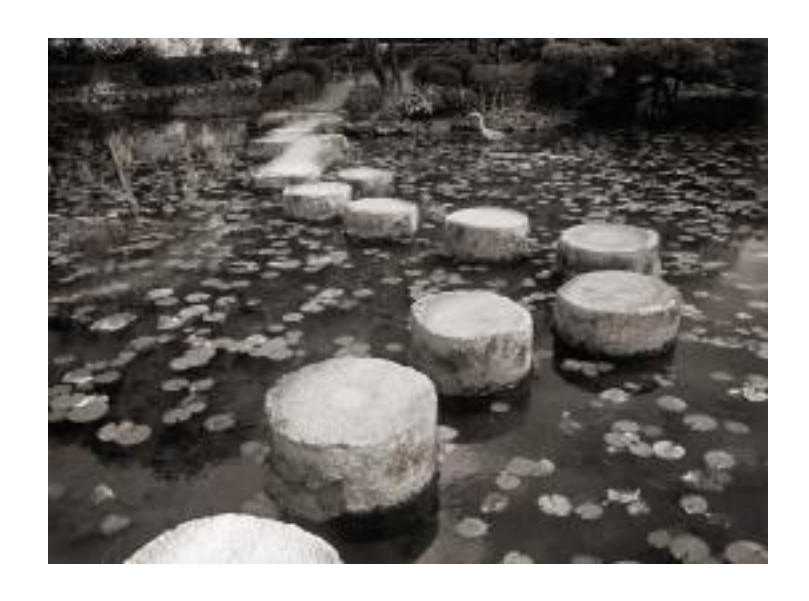
Stepping Stones To An Extraordinary Journey