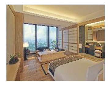
Choose from among the finest accommodations in our Luxury Hotel and Ryokan Collection

From being able to recommend a luxury hotel with impeccable service and the most splendid views of Tokyo's glittering skyline to a serene and tranquil inn in the remotest part of Japan, we will work with you to ensure that your accommodations in Japan will be extraordinary with the finest hospitality, cuisine and ambiance.